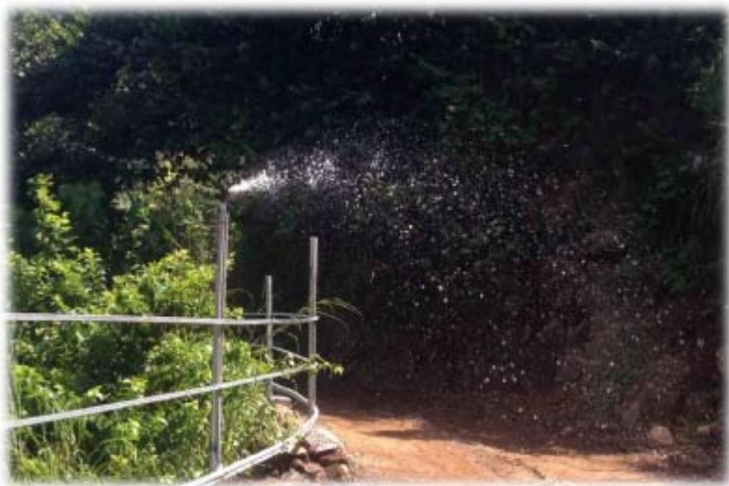
Photographs showing the Fixed Water sprinkling system installed on the road sides and project area