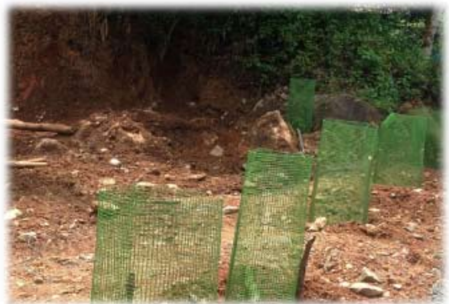
Photograph Showing Avenue trees planted and existing vegetation along the road sides and project area