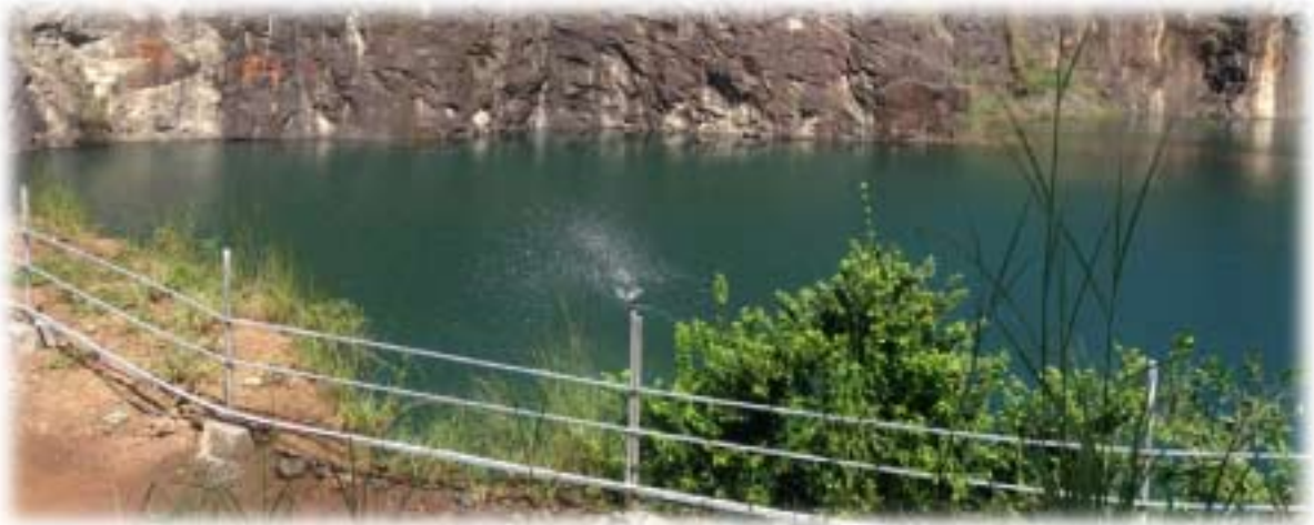
Photographs showing the rainwater harvesting system in the project area