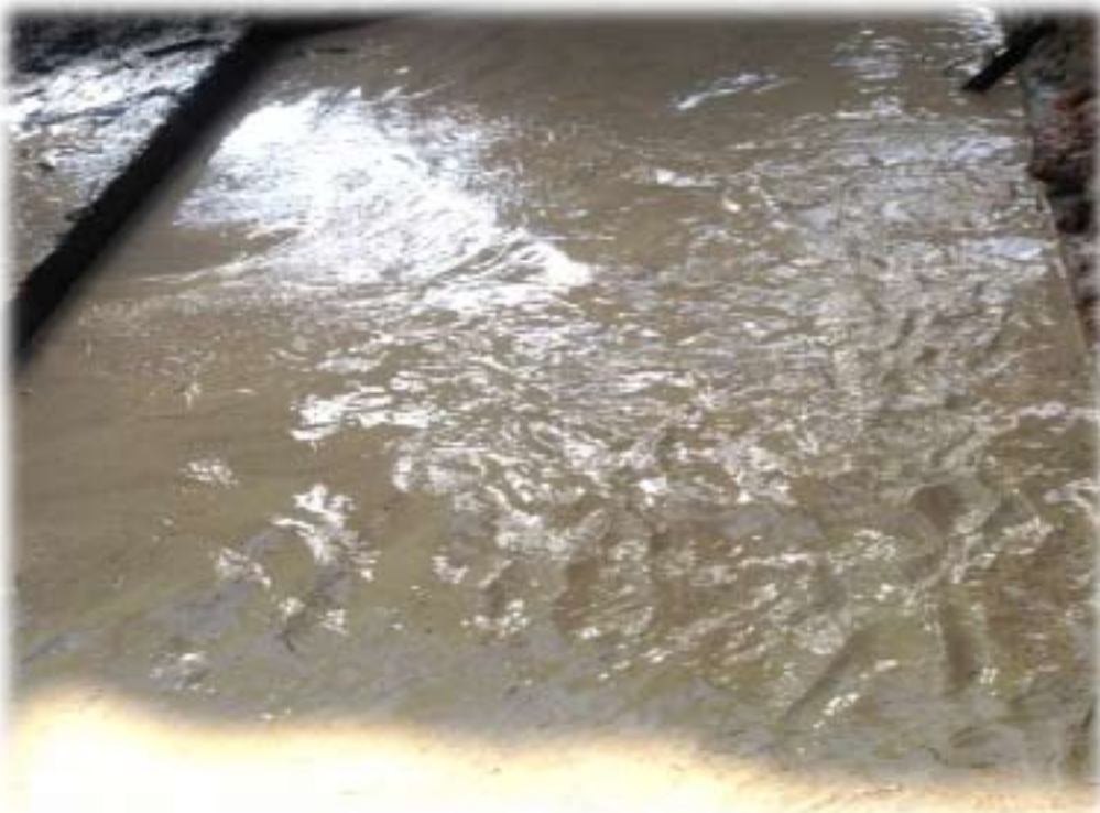
Photograph showing Garland drains with silt trap through the project area