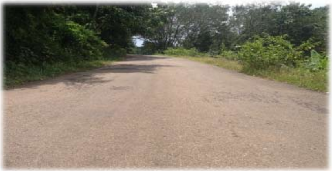
Photographs showing tarred access road to the quarry.